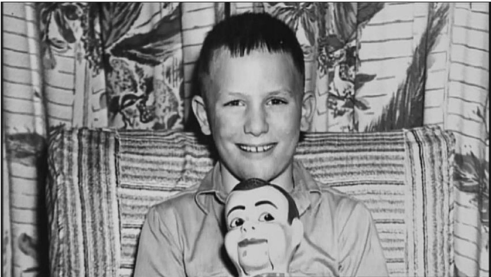
I became a Carville patient during my fourth grade school year