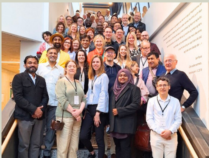
GPZL Zero Transmission Symposium: University of Bergen, Norway, 23-25 May 2024